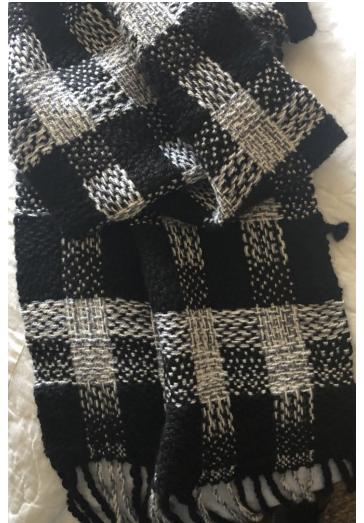
Pam's scarf, the black yarn is Pam's alpaca, the white/grey is 50% merino/ 50% silk.

Not pictured was a grey and blue shawl, a great example of clasped weft weaving.