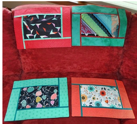
Pandemic Place Mats