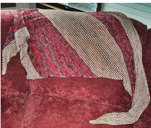
Lilli Pilli Shawl

We don't know what the next chapter of this story will be; I just hope it won't involve a virus.