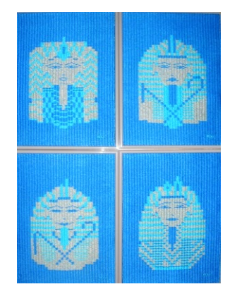
The Tutankhamen Masks

Other patterns have been woven with gilt threads and rich colors of garnet, lapis lazuli, and turquoise like the jeweled artifacts of Tutankhamun. Playing with color, pattern, and structure, I reinterpreted the four mummy case portraits of Tutankhamun with a weave structure (taqueté) borrowed from Coptic Egypt.