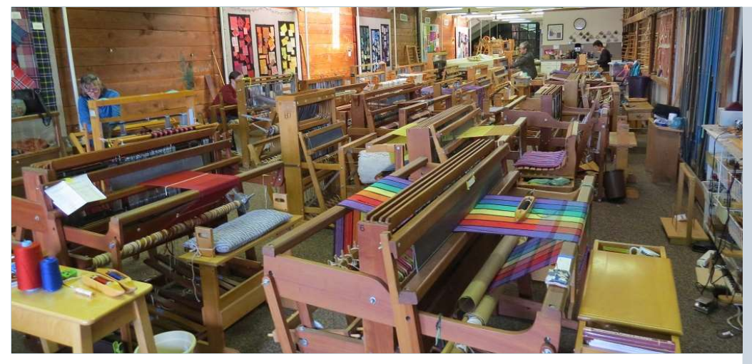
Located in the beautiful, historic Mill Building at Willamette Heritage Center