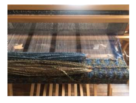
Bound weave using 4 strang cabled handspun