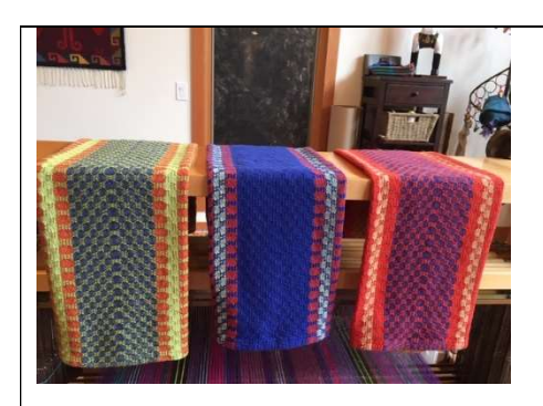
I just love the fun differences on one warp you can get with M's and O's. With 3 weft colors: kiwi, cayenne and royal in 8/2 cotton, the tryptic is really fun!