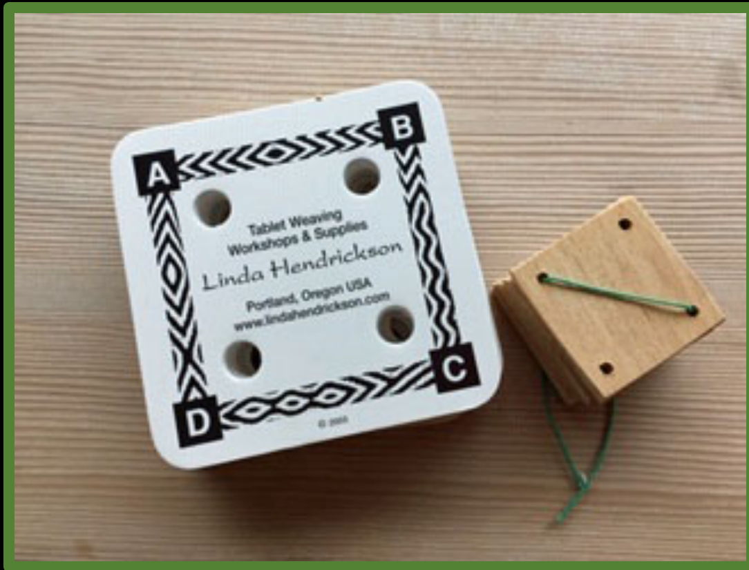
Replica of card weaving tools found in the Oseberg Viking ship