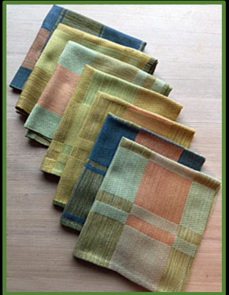
Napkins in 3/1 1/3 20/2 cotton