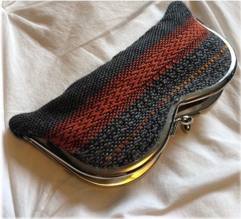
4 shafts with freeform treadling