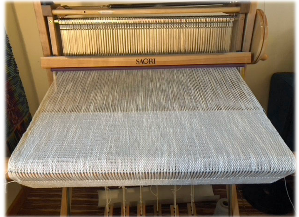
Plain Weave Bread Cloths - using GIST Yarn - Mallo in both warp and weft