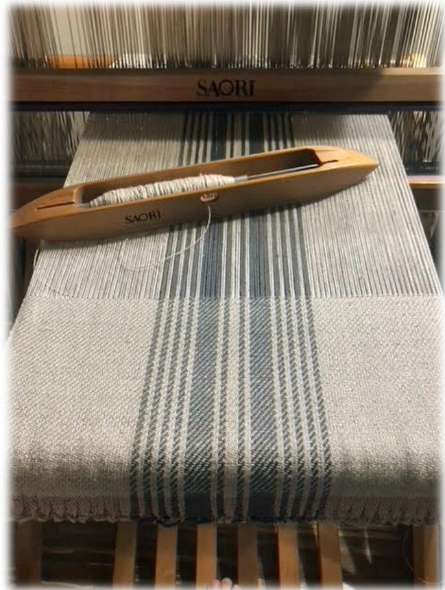
Denise Wild: Twill Cottolin Bread Bags