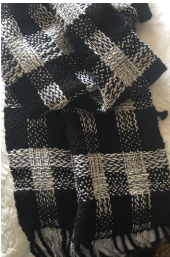
Pam's scarf, the black yarn is Pam's alpaca, the white/grey is 50% merino/ 50% silk.