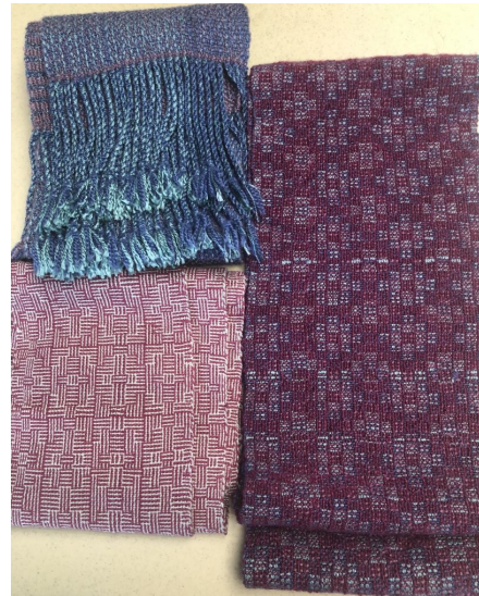
Nancy B's scarves.

Not pictured was a grey and blue shawl, a great example of clapsed weft weaving.