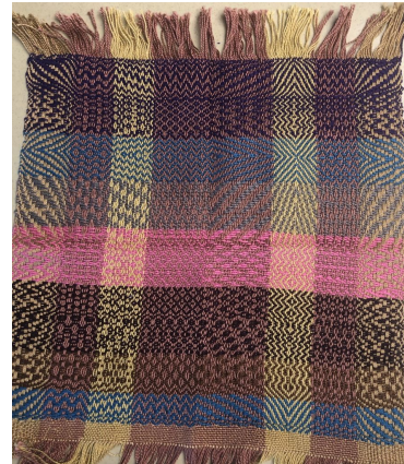
Mickey's gamp learning more about twill.