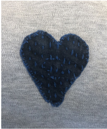
Vicki's sample of Sashiko Mending